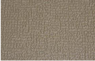
Vinyl Embossed - Sand