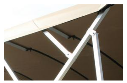
Zippered bow pockets - Fast removal