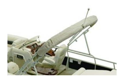
(2) Free matching boots included